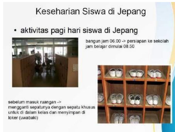
Figure 4 Examples of character education in Japan

The material for introducing character education in Japan by member II is delivered in class while listening to the power point material presented .