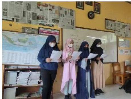
Figure 5 Practice singing the Japanese version of "Kasih Ibu" song in front of the class

Evaluation and monitoring activity is only carried out in the form of classroom practice by students, so there is no assessment in the form of pretest or posttest.