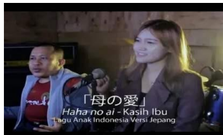
Figure 2. The Japanese version of the video clip of “Kasih Ibu” song

Basic introduction material through the Japanese version of the song's lyrics by the head of the implementation team by playing a video clip from the youtube account: entossjp and the students listening to the lyrics of the song from the print out that has been distributed.