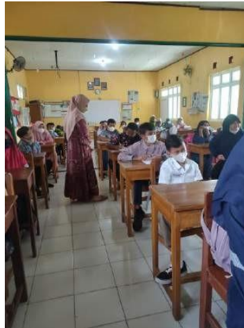
Figure 1. Class atmosphere when students listen to the service material by the implementation team

The following is an example of the material delivered in grades IV and V at SDN 2 Candirejo, West Ungaran, Semarang Regency.